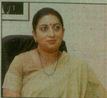
Smriti Zubin Irani